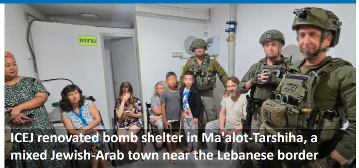
ICEJ renovated bomb shelter in Ma'alot-Tarshiha, a mixed Jewish-Arab town near the Lebanese border