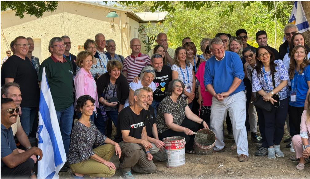
ICEJ national representatives visit Kibbutz Be'eri