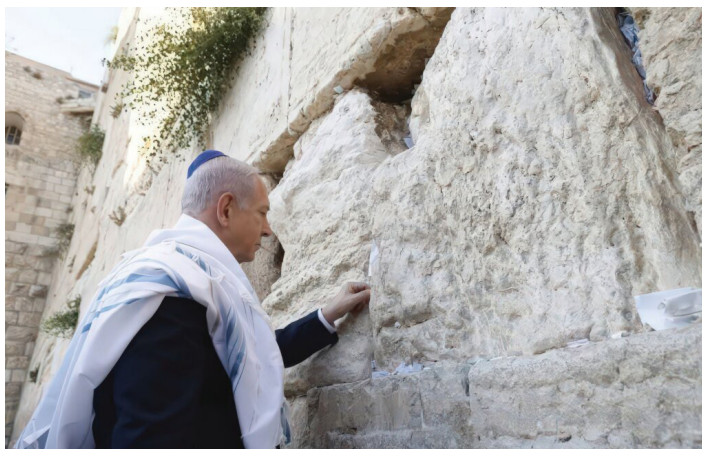
Netanyahu slips a prayer note into Western Wall stones.

There is an ever-increasing respect of Israel since the War of Independence in 1948. The Six-Day War and Yom Kippur War,