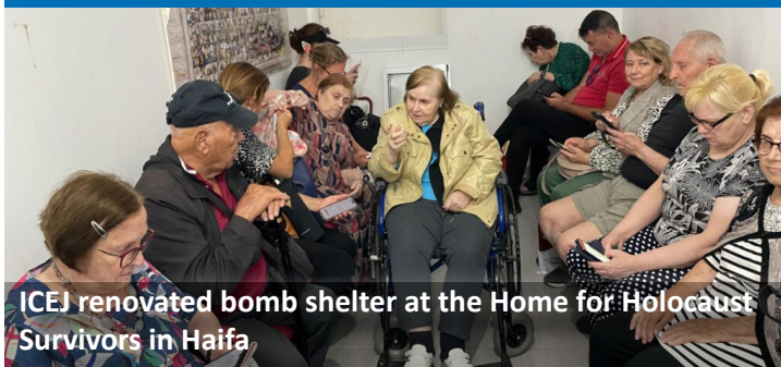
ICEJ renovated bomb shelter at the Home for Holocaust Survivors in Haifa