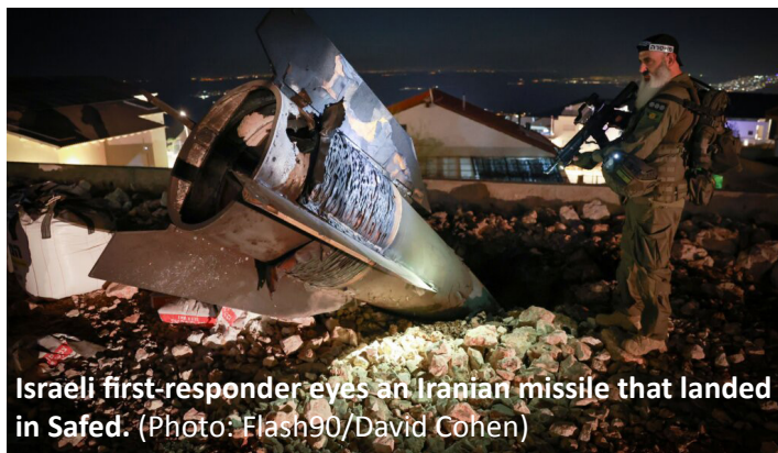
Israeli first-responder eyes an Iranian missile that landed in Safed.

In that day I will make the governors of Judah like a firepan in the woodpile, and like a fiery torch in the sheaves . . . In that day the Lord will defend the inhabitants of Jerusalem; the one who is feeble among them in that day shall be like David, and the house of David shall be like God . . . in that day . . . I will seek to destroy all the nations that come against Jerusalem. (Zechariah 12:6–9 NKJV)