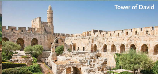
Tower of David