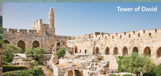
Tower of David