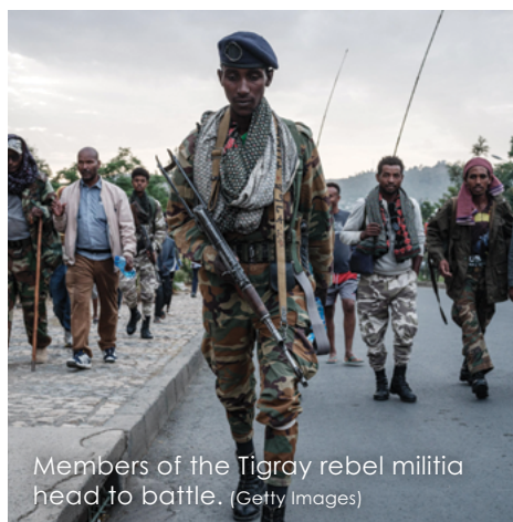
Members of the Tigray rebel militia head to battle.

In late November, the Israeli cabinet approved plans to bring home 3,000 more Ethiopian Jews in an emergency airlift out of war-torn Ethiopia. At the request of the Jewish Agency for Israel, the International Christian Embassy Jerusalem immediately committed to assisting with this urgent and historic Aliyah operation.