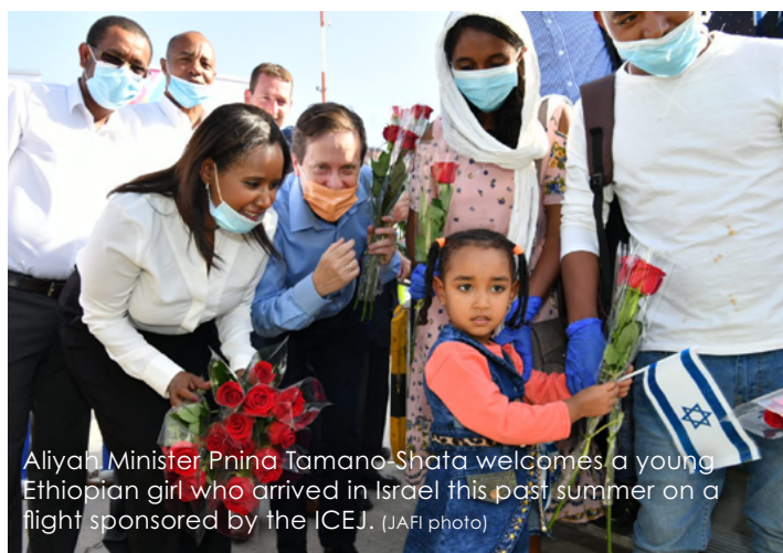
Aliyah Minister Pnina Tamano-Shata welcomes a young Ethiopian girl who arrived in Israel this past summer on a flight sponsored by the ICEJ.

The Christian Embassy has pledged to be an active partner in this emergency airlift by sponsoring several hundred Ethiopian Jews on the first flights coming out of Addis Ababa. With your help, we can bring home even more, so they can reach safety in Israel and finally reunite their families in the promised land. 🌍